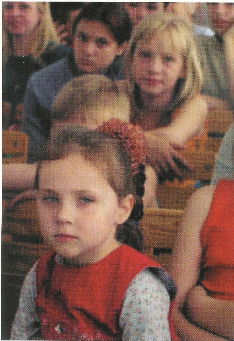
The next generation Children still suffer the effects of the 1986 explosion of the Chernobyl reactor (opposite).