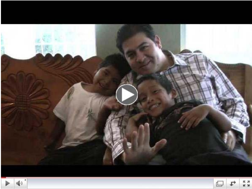
Eagle's Nest orphanage visit