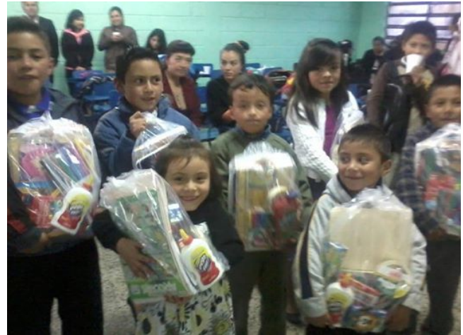
Children receiving gift from Australia LifeNets

We focused on providing a bag of complete school supplies. We used a wholesale bookstore which offered very favorable prices, benefitting 62 students from the pre-primary level to university level. For the children in most need we also purchased a pair of shoes and uniforms (blouses, vests).| Many thanks and please receive our gratitude.