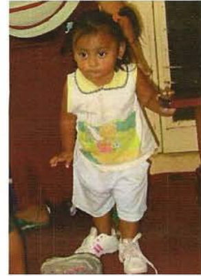
We had to fight the urge not to just pick one of these children up and bring them home