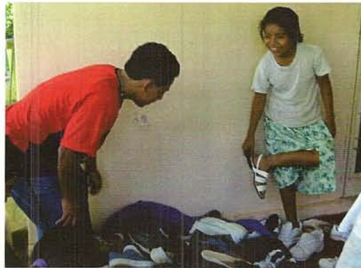
Even the big kids showed up