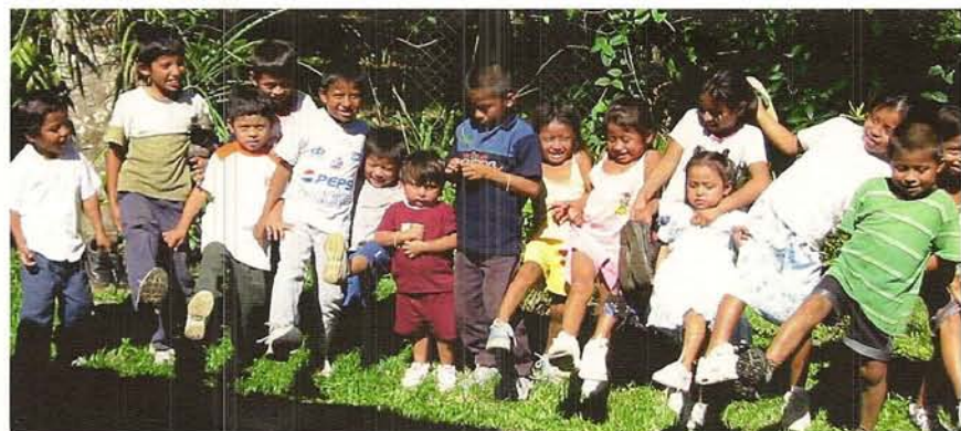
This is one of the after pictures. Don't let the red shirt guy fool you. He's ecstatic