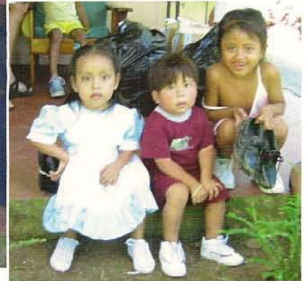
He does like having his picture taken