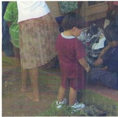
Maybe there is another pair