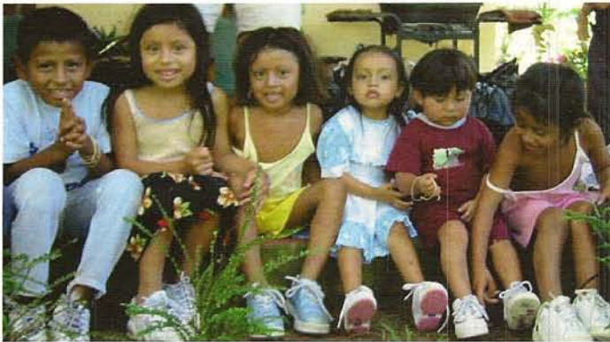
Here red shirt is getting lessons about tying his new shoes