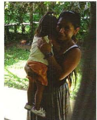
It's so sad. They start having children so young