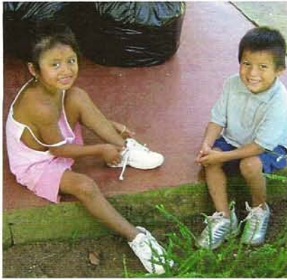
This brother and sister seemed happy