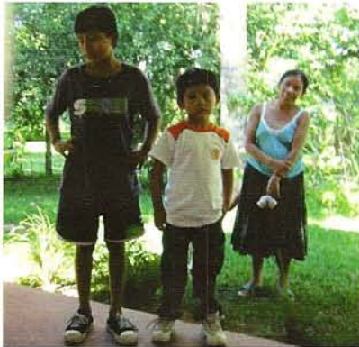
Maybe the boys want to show that they're tough guys. What's the big deal with new shoes?