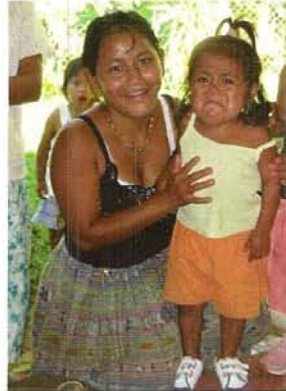
You can't please all the people all the time