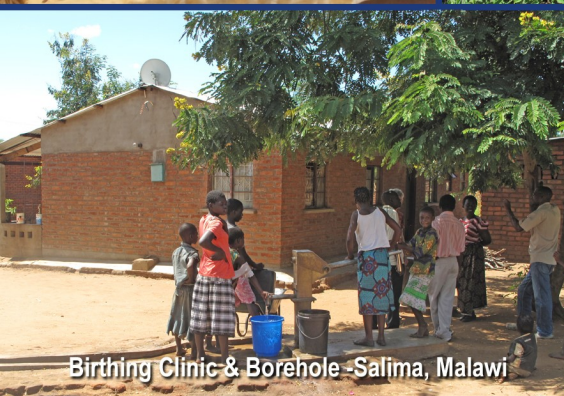
Birthing Clinic & Borehole - Salima, Malawi