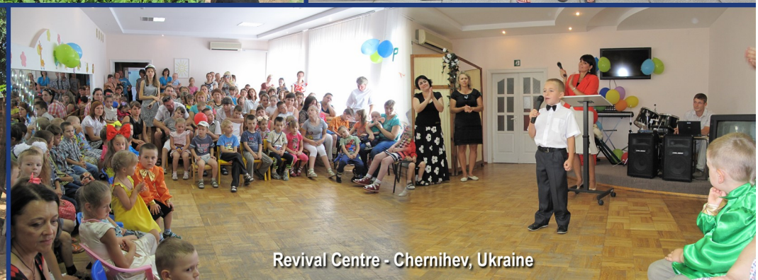
Revival Centre - Chernihiv, Ukraine