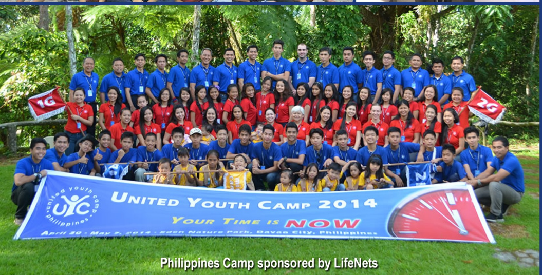
Philippines Camp sponsored by LifeNets