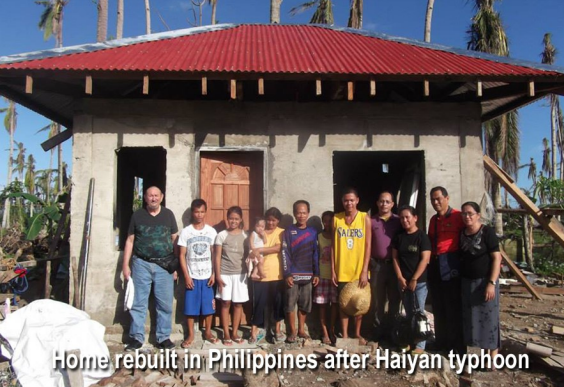
Home rebuilt in Philippines after Haiyan typhoon