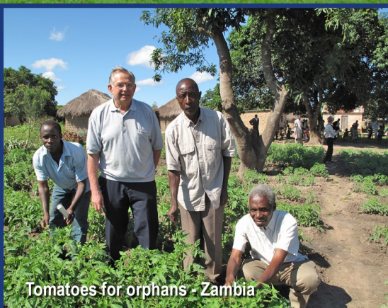
Tomatoes for orphans - Zambia