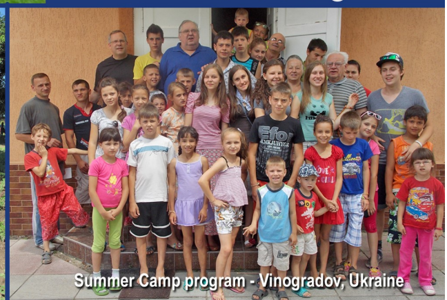
Summer Camp program - Vinogradov, Ukraine