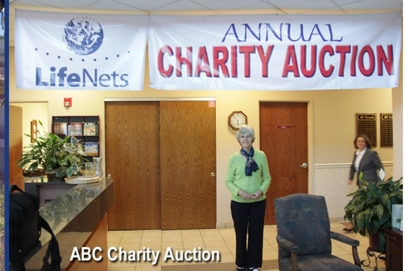
ABC Charity Auction