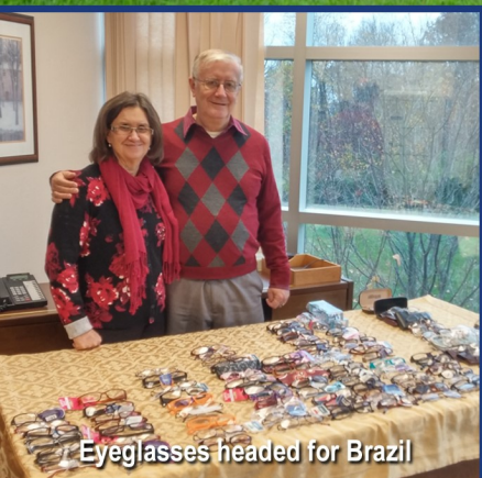
Eyeglasses headed for Brazil