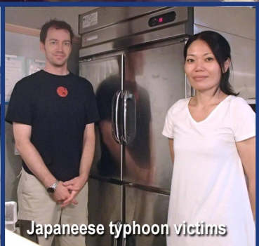
Japanese typhoon victims