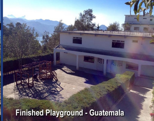
Finished Playground - Guatemala