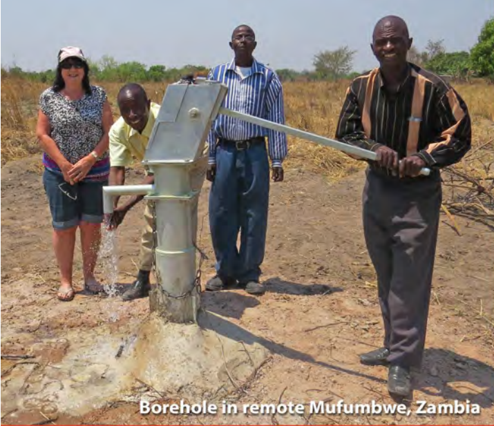
Borehole in remote Mufumbwe, Zambia