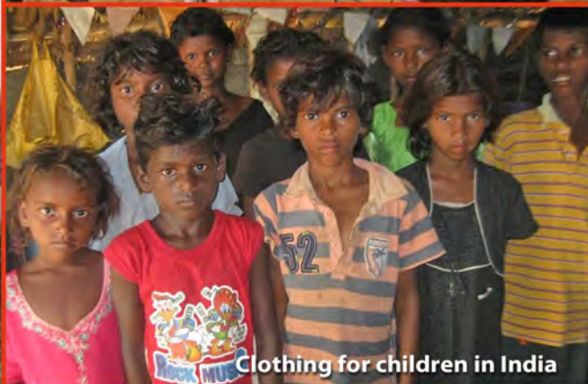
Clothing for children in India