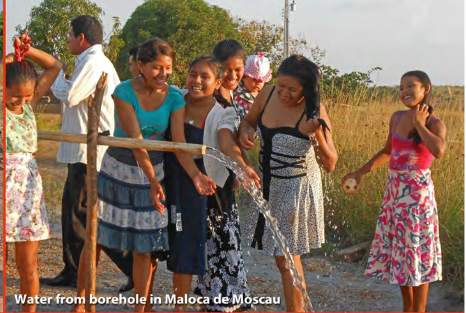
Water from borehole in Maloca de Moscou