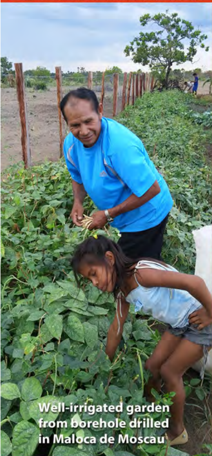
Well-irrigated garden from borehole drilled in Maloca de Moscou