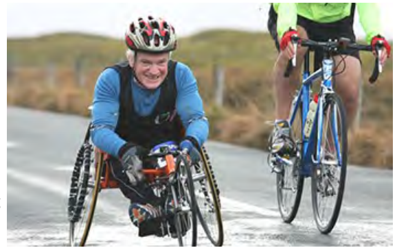
Undisputed Run “Virtual Keep Moving” event

Also, Undisputed Runs, LLC, highlighted LifeNets in a January 2015 running and cycling fundraising event called “Virtual Keep Moving.” and gave $5 for every registration to LifeNets. Undisputed Runs LLC is dedicated to promoting fitness and well-being at all ages and capabilities. This event is designed to increase awareness spinal cord injury. More at http://lifenets.org/lnmisc/undisputedrun/wheelchairundisputed.html .