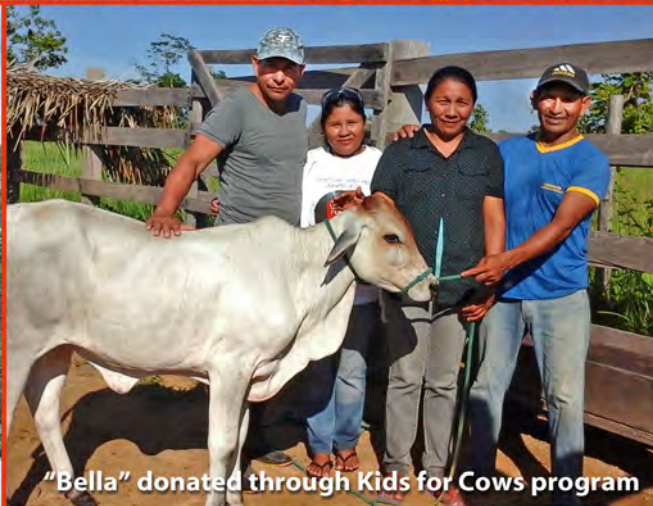
"Bella" donated through Kids for Cows program