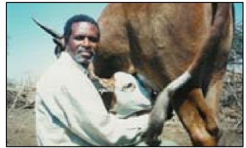
Our first calves in Mumbwa. Calves and education being passed on to others. Those who were in need now practice the way of give.

When someone who is hungry is fed, a need is met. When we can help them feed themselves and their communities, lives are transformed. LifeNets is our vehicle for creating these opportunities to benefit the lives of others who have a genuine need.