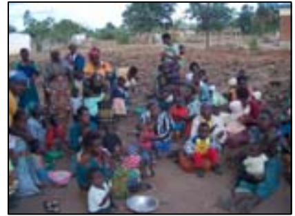
LifeNets feeds 195 AIDS orphans daily in Malawi.

These are a few of the projects begun or completed by LifeNets in 2002 that have met real needs and transformed the lives of people and communities. They are steps that you, our LifeNets family, have taken to make a difference.