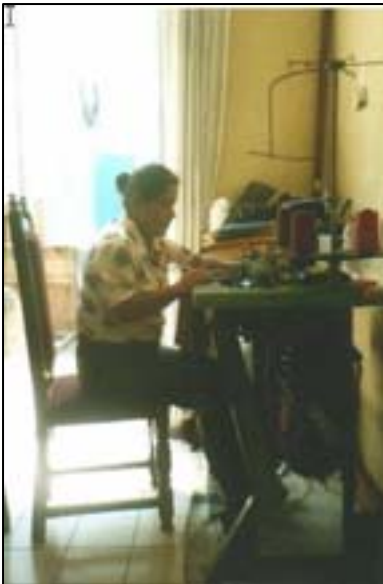
Sewing machines provide incomes in Guatemala.

Dedicated to helping feed street children and giving them a source of hope, each $300 US that we send is feeding a child for a year in the "Light of Love" mission in Vinogradov, Ukraine. In addition to medical facilities we are supporting 195 AIDS orphans in the African nation of Malawi.