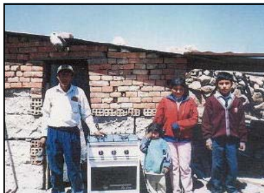
Left: Small business through which a Peruvian family of ten becomes self-supporting by cooking seeds that are used for making popular local beverage.

In Guatemala, Peru, Sri Lanka and Malawi we have helped the unemployed with grants to start small businesses that have helped them to become self-supporting.