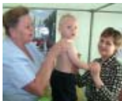
Therapist massaging boy with his mother close by.

The "Revival" Centre for Disabled Children is a dream that LifeNets has had a part in turning into reality. After the terrible 1986 nuclear accident the Ukrainian, then Soviet, government decreed that a children's rehabilitation center be constructed in each of the 24 provinces. But, after ten years, only eight were built. Complicating things was the fact that Ukraine became independent in 1991 and was having to deal with the effects of the disaster alone. Critical facilities to rehabilitate elevated incidences of cerebral palsy, epilepsy, speech defects, learning disabilities and other problems were non-existent.