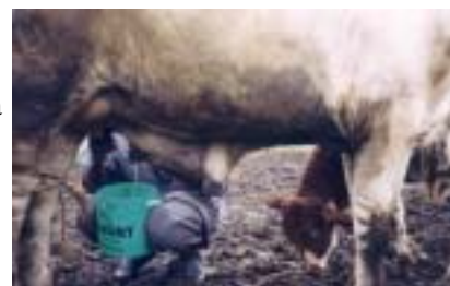
Milking in progress.

As a matter of fact, since the program started, we have had no deaths from malaria or diarrhea. There is no malnutrition among our children either.