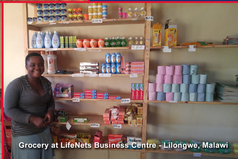
Grocery at LifeNets Business Centre - Lilongwe, Malawi