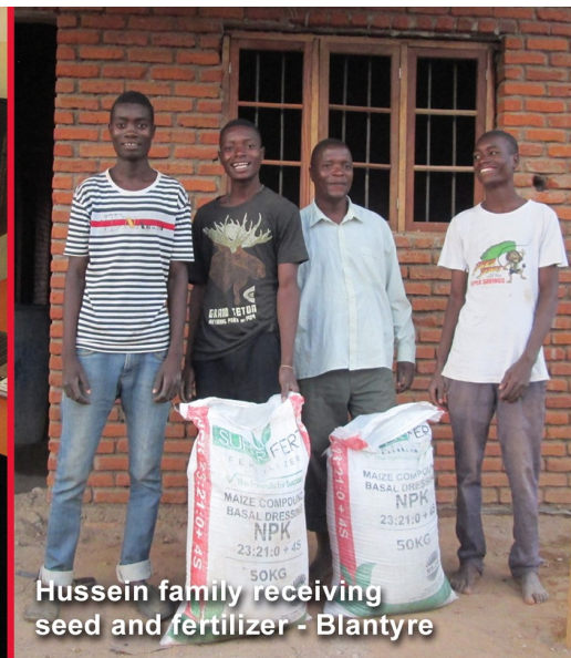
Hussein family receiving seed and fertilizer - Blantyre