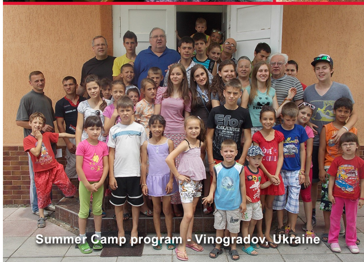
Summer Camp program - Vinogradov, Ukraine