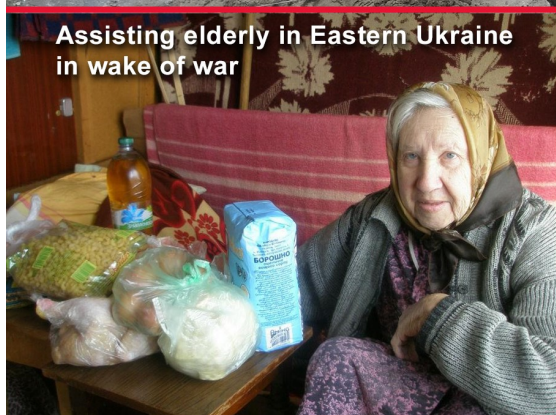
Assisting elderly in Eastern Ukraine in wake of war