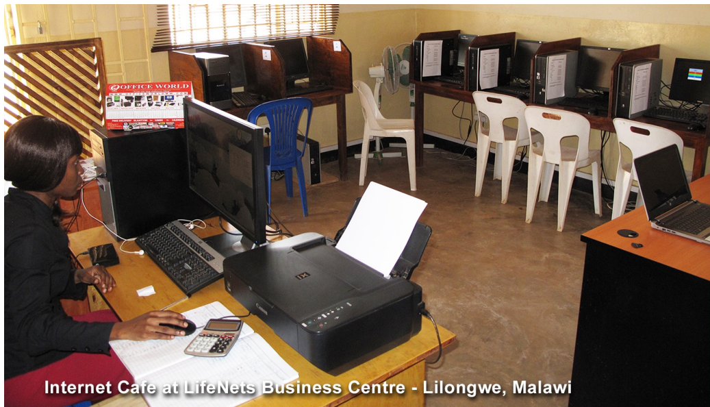
Internet Cafe at LifeNets Business Centre - Lilongwe, Malawi