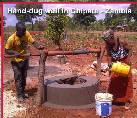
Hand-dug well in Chipata - Zambia