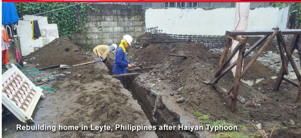
Rebuilding home in Leyte, Philippines after Haiyan Typhoon