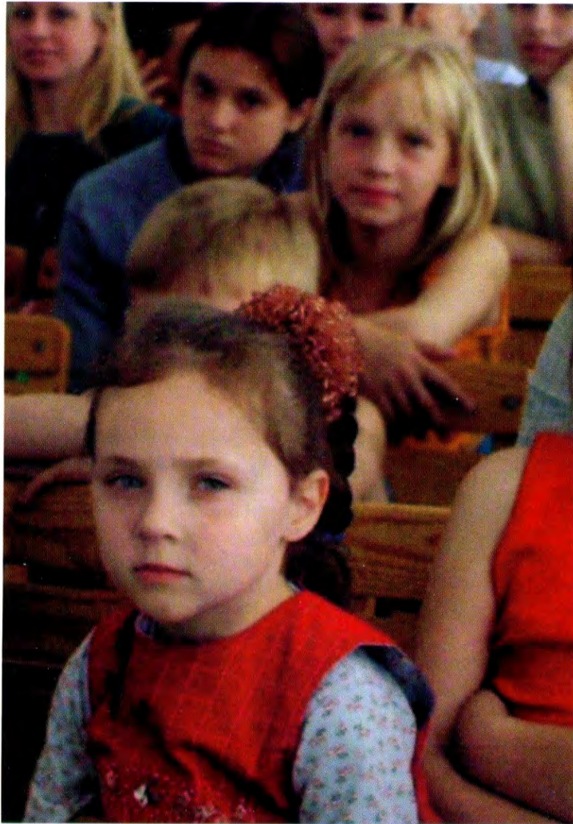
The next generation Children still suffer the effects of the 1986 explosion of the Chernobyl reactor (opposite).