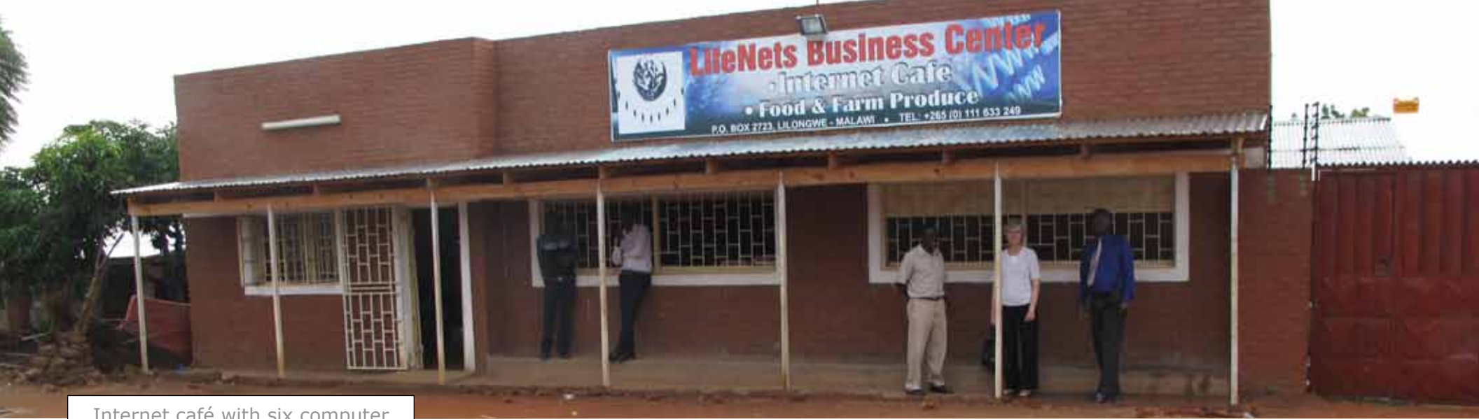
Internet café with six computer stations, copier and printers at the LifeNets Business Center in Lilongwe, Malawi.