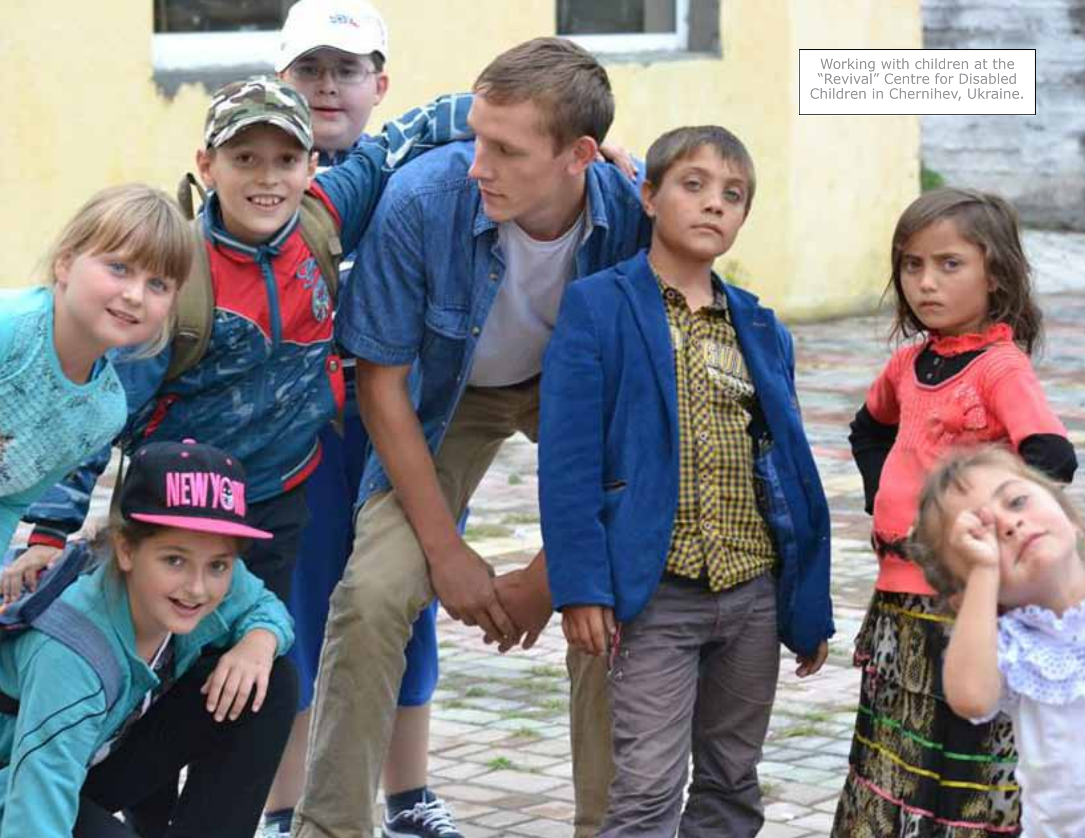
Working with children at the "Revival" Centre for Disabled Children in Chernihev, Ukraine.