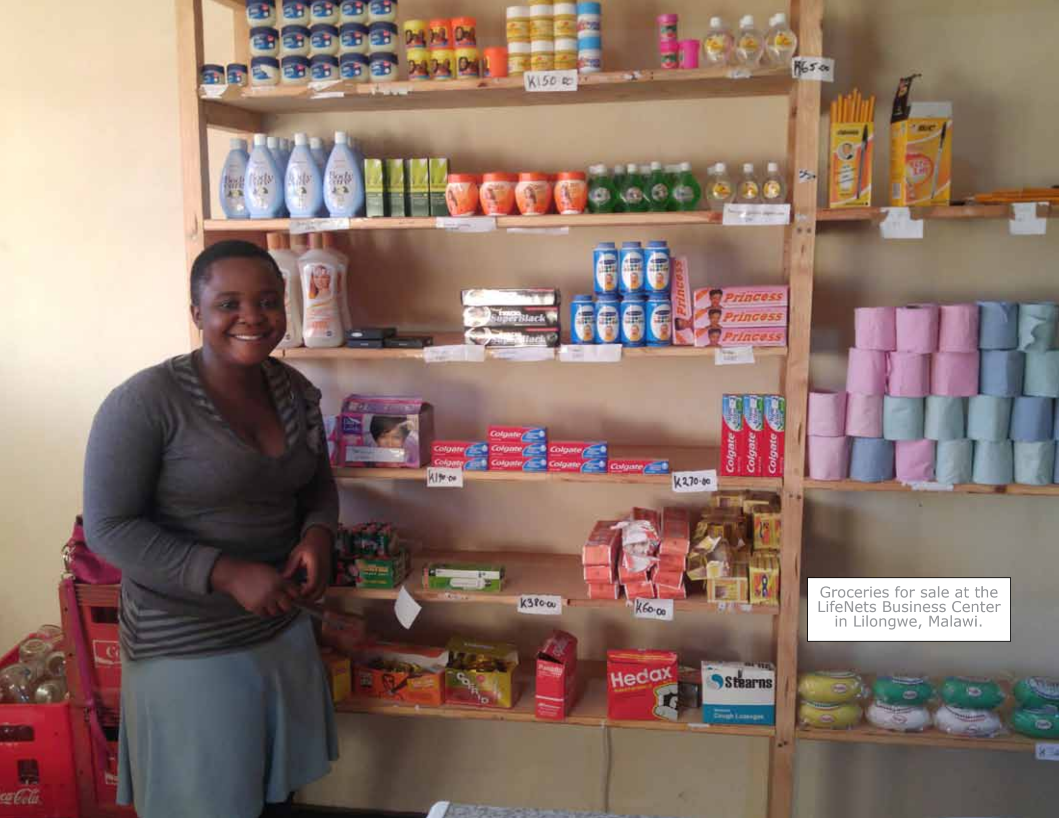
Groceries for sale at the LifeNets Business Center in Lilongwe, Malawi.