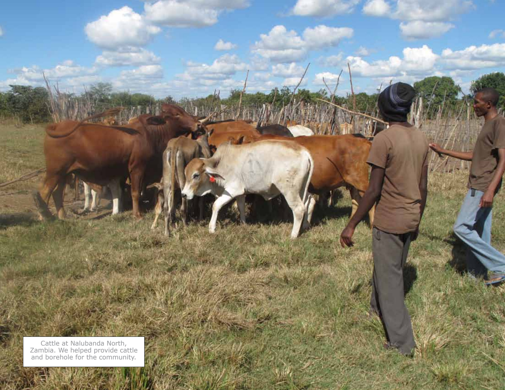
Cattle at Nalubanda North, Zambia. We helped provide cattle and borehole for the community.