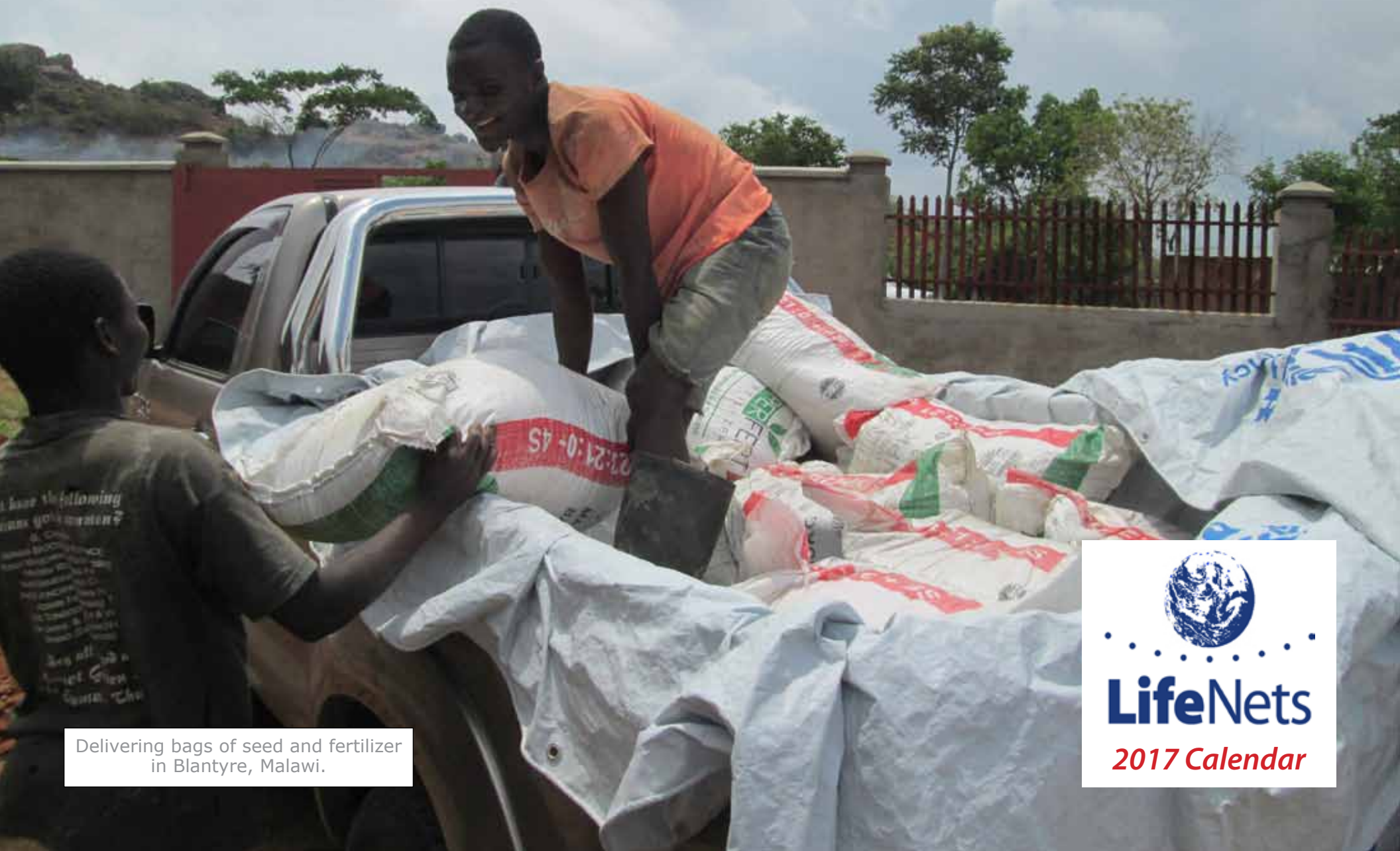
Delivering bags of seed and fertilizer in Blantyre, Malawi.

Thank you for helping us to help others!