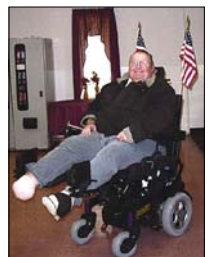
Happy recipient of custom power chair that gives freedom to get around.

Through our Web site we receive a steady stream of donations of both manual and power wheelchairs. We also receive as many requests for wheelchairs. This has become a valuable service to many here in the United States. LifeNets acts as a clearinghouse for these donations and aids in the shipment of wheelchairs to needy recipients.