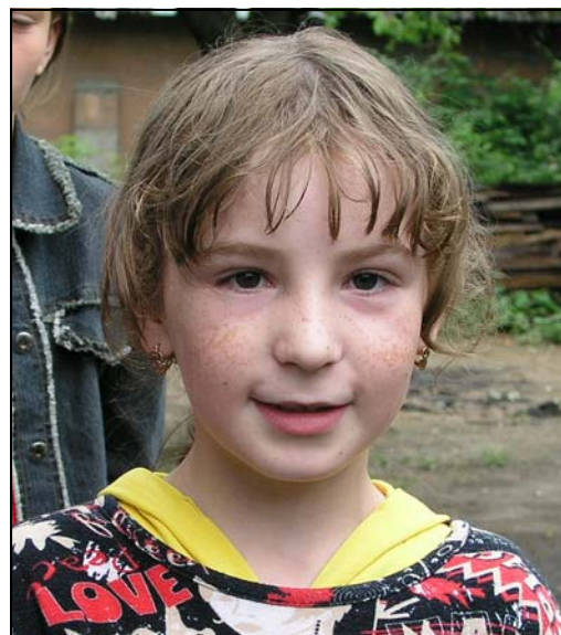
In Vinogradov, Ukraine LifeNets is giving smiles to 40 street children who now have hope instead of uncertainty.