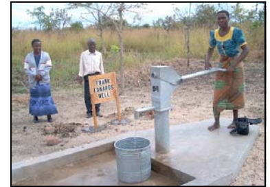
Well provides clean water daily for 60 Malawians.

Water is essential to life. The biggest cause of disease lies in contaminated and unsafe drinking water. Wells, such as the one pictured on the right, minimize the risk of disease and provide the wonderful convenience of easily accessible water, something most of us take for granted. Two years after the request to drill a water well in Nyanyara, Malawi, the project is now complete and providing a source of clean drinking water for more than 60 people. Previously many of them had to walk up to two miles for water.