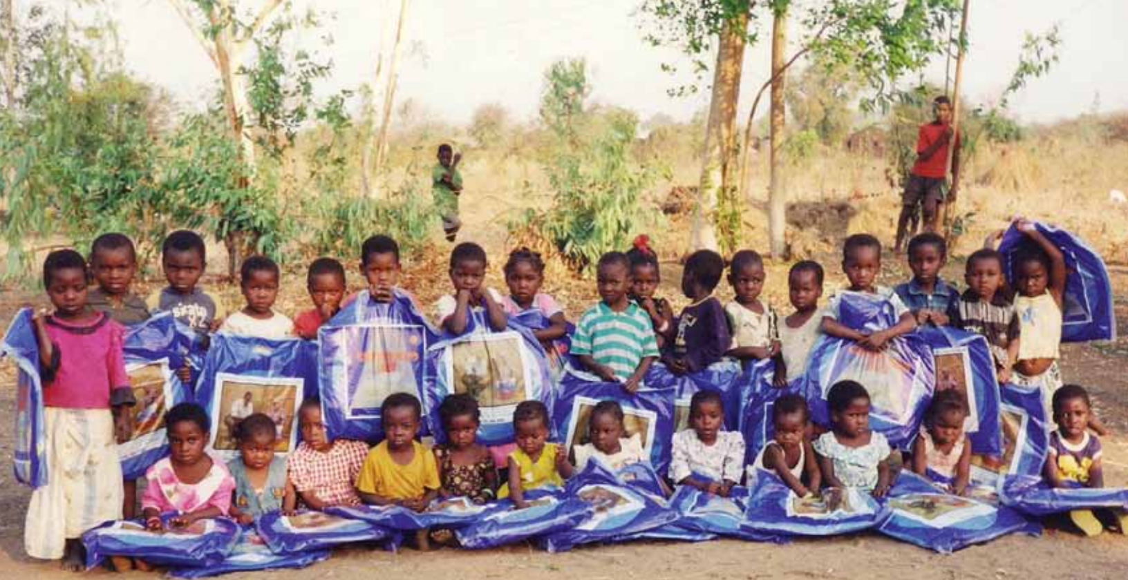
LifeNets distributed mosquito nets to children in Chapita Village, Malawi. Money for the nets was raised by a teen fundraiser in the Portland, Ore./Vancouver, Wash. area.