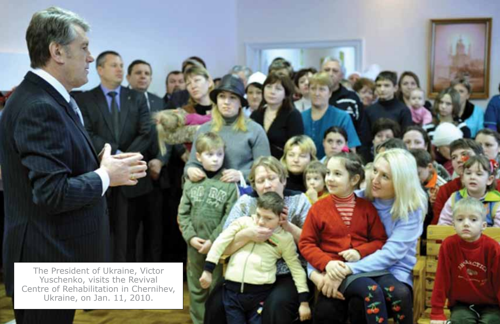
The President of Ukraine, Victor Yushenko, visits the Revival Centre of Rehabilitation in Chernihev, Ukraine, on Jan. 11, 2010.