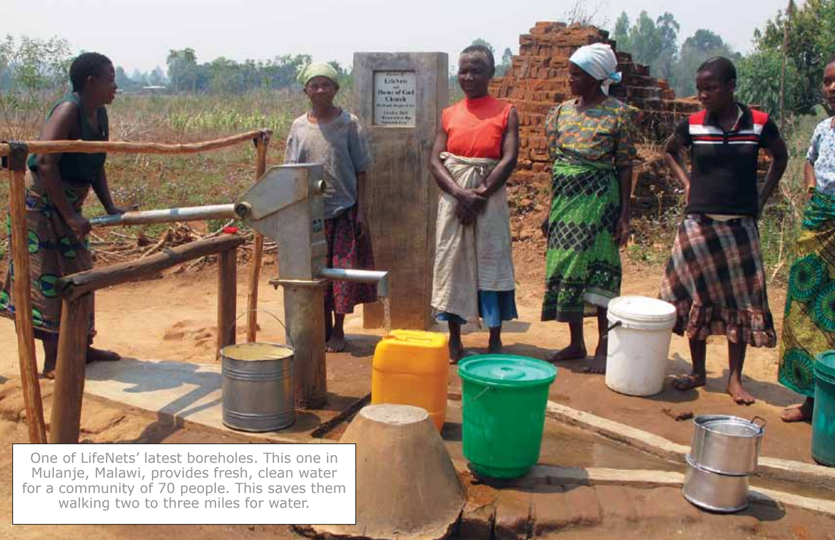
One of LifeNets' latest boreholes. This one in Mulanje, Malawi, provides fresh, clean water for a community of 70 people. This saves them walking two to three miles for water.