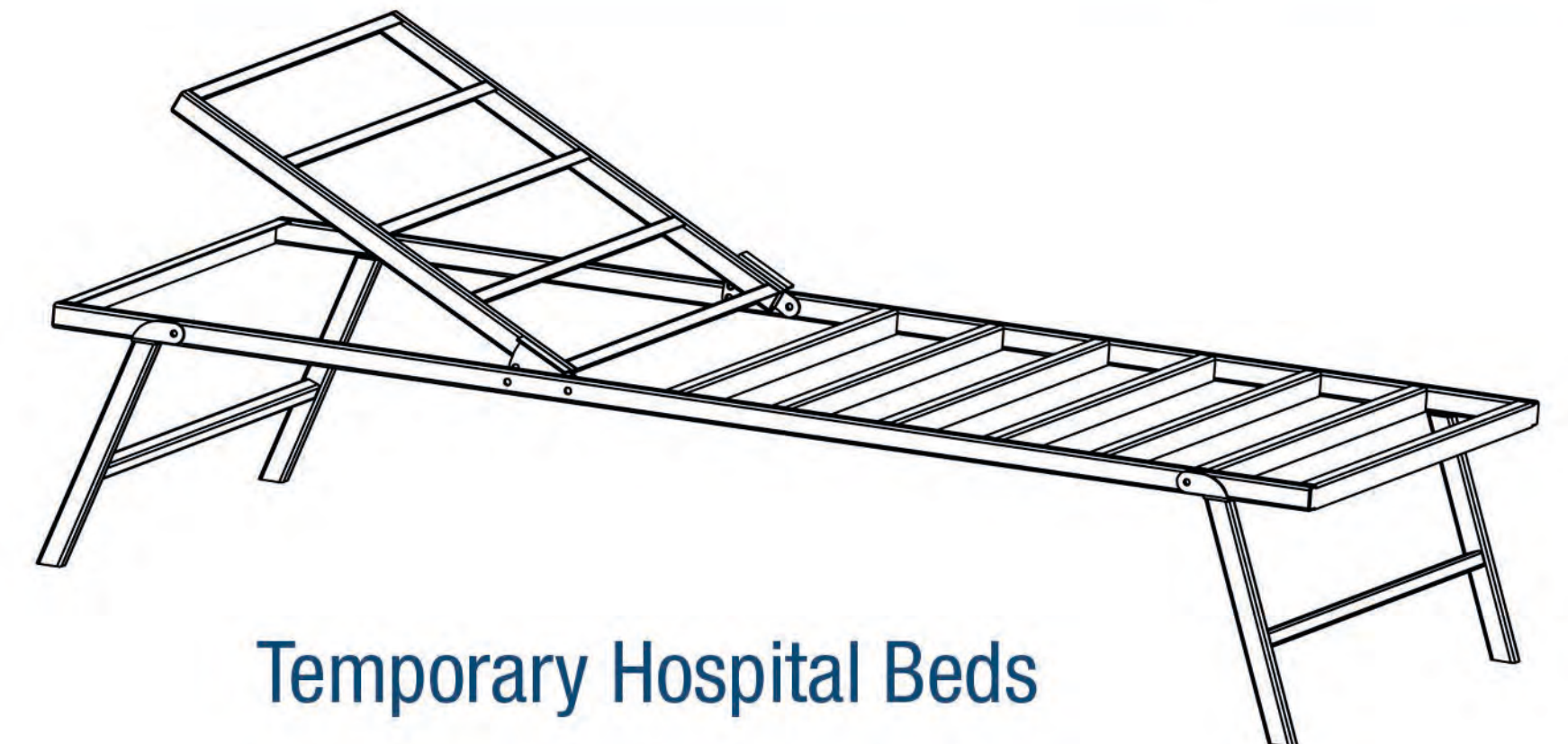
Temporary Hospital Beds